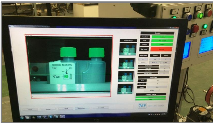
IMPACT Software customised to client's requirements.