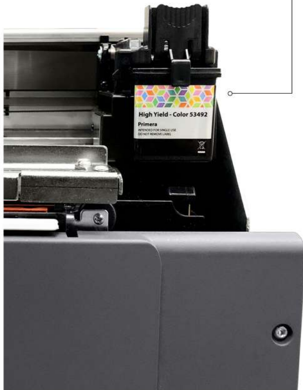
Under the Hood

LX910's technology allows you to easily switch between dye and pigment ink without having to change the print head.