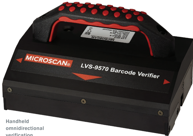
Handheld omnidirectional verification