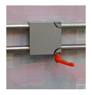
Well thought out details: