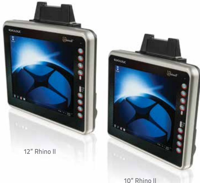
12" Rhino II

NOTE: The Android robot is reproduced or modified from work created and shared by Google and used according to terms described in the Creative Commons 3.0 Attribution License.