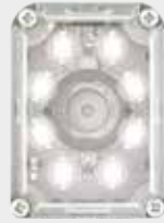
WHITE WITH POLARIZER