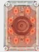
RED WITH POLARIZER