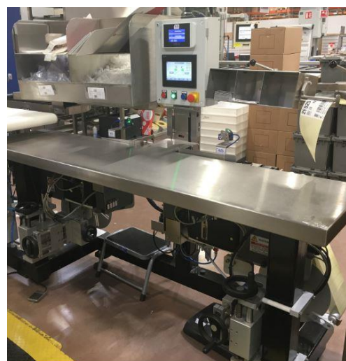
Label is inspected by the Datalogic Matrix 210 and the AIS VB6.