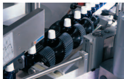
Double scroll with external gear

The other optional accessories in the HERMA 362 M Series also help to enhance flexibility.