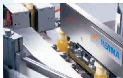
Plate-type separator and centring unit

Additional monitoring functions for the end of the tape, web break and missing labels can be integrated if required. There are special safety options, such as a code reader, print control or eject stations, for more complex applications.