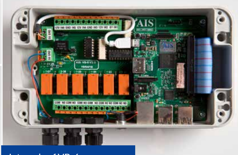
Internals of VB-6