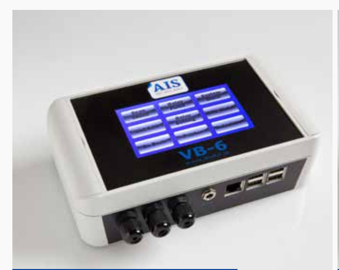
Main Menu Screen