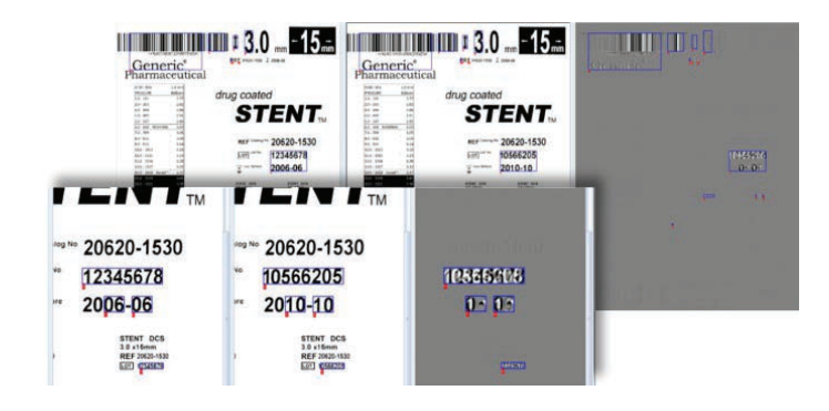
Comparison Tri-Window featuring zoomed view of Difference Map.

Results are displayed in a 3-paned window; Master document, Sample document, Difference Map. The Difference Map allows quick visual inspection reflecting differences between the documents. Computer generated rectangles represent divergence between the Master and Sample.